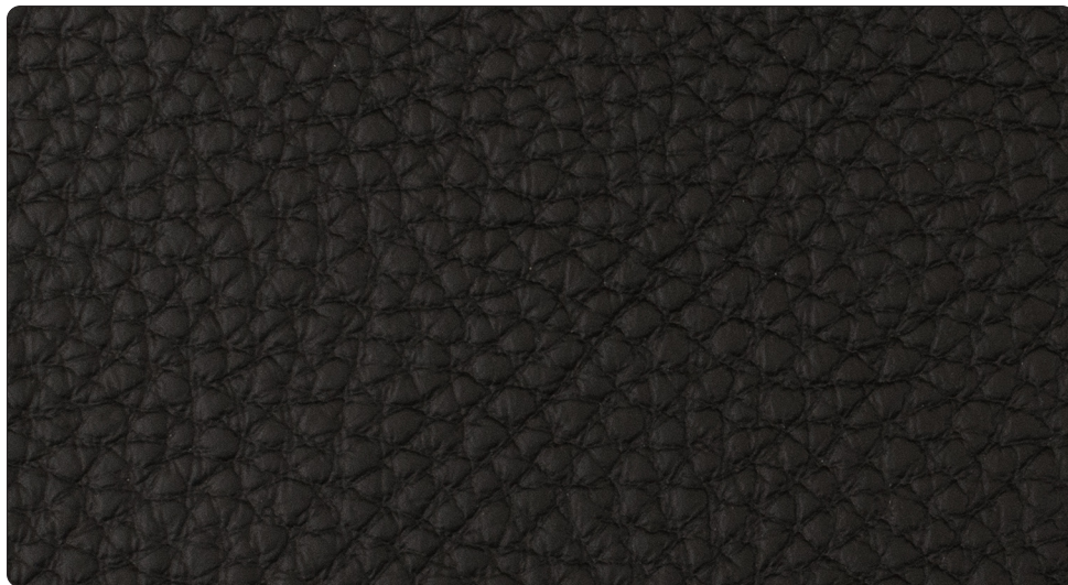
GA99056 - Nero