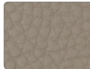
GA99060 - Chai