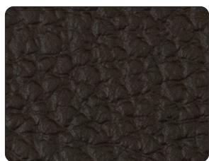
GA99057 - Doppio