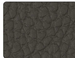
GA99059 - Affogato