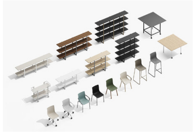
Keilhauer: Epix Collection

Epix was developed through research and examination. At the early onset, a research study, including interviews and surveys, examined how people used the office and what they most desired to see in the future. Above all else, gathering spaces were identified as the most important area of focus. Epix Seating , made entirely from pure materials, features a pure aluminum frame base that holds the shape of the seat shell, which is made of pure polypropylene plastic or pure PET felt. An additional upholstered seat pad with a recycled plastic insert can be installed and easily removed when the time comes for recycling. Epix Tables are a mobile surface solution that can be arranged for small work groups, or combined to accommodate large-scale gatherings. Square shaped with two casters for easy arrangement, they are available at conference and bar height. Epix Shelving and Storage provides a visual divide and, with the addition of knockout, movable felt panels, physical and auditory privacy as well. Read More