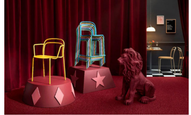
Division Twelve: Catty

>Division Twelve's new minimalist seat, Catty, was created by EOOS in response to a design brief that began with the question "What is the least amount of material required to create a chair?" Catty consists of only two curving steel tubes which form a backrest, and a smooth, thin plane of steel or wood veneer to form the seat. "The shape is created by two sets of lines that meet for only a moment before they go off on their own again," said EOOS Designer Martin Bergmann. "The lines of the back curve under the seat to form an endless loop. With arms, this same line appears to twist up and around organically." Prototyped with the code name "The Barely There Chair," Catty's design is intended as a way to push the boundaries of the eco-conscious line of commercial furnishings. Already, the entire Division Twelve collection of seating is 100% recyclable, and uses Forest Steward Certified wood for all solid wood options; Catty's minimalist form helped to explore minimal resource use. "The simplicity of the