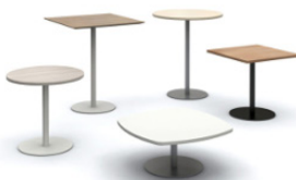
AIS introductions (clockwise from top left): O Leg, Tri-Wheel Mobile Divider with Lexan Channel Screen, Revere™ Task Chair, Disc base for Day-to-Day® Tables, Essex™ Task Chair