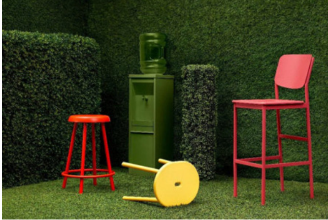
Division Twelve. New Outdoor & Stained Oak Options

resistant to mold, mildew, extreme weather, and impact to preserve beauty and quality over extended use. It stands up to rigorous sanitization and cleaning processes – including the use of bleach – for environments with high infection control needs. The material is also one of the easiest and most commonly recycled plastic products in the marketplace. “Those who enjoy the outdoors should have a vested interest in protecting them – so we are thrilled to offer an outdoor line of seating that is 100% recyclable,” said Josephine Abate, Division Twelve Sustainability Officer. “They are the perfect closed loop product with no