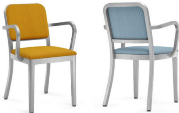
Emeco: Navy Officer by Jasper Morrison

With a long history, not to mention its countless cameo appearances in films and TV series, the upholstered Navy Officer series was first introduced in 1948. As U.S. Navy Officers were being redeployed to land-based facilities, they wanted a little more comfort than the shipboard 1006 Navy chair pro-