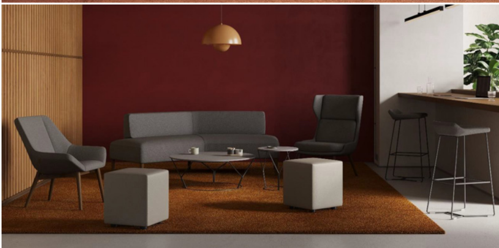
Keilhauer: Vagabond and Dally