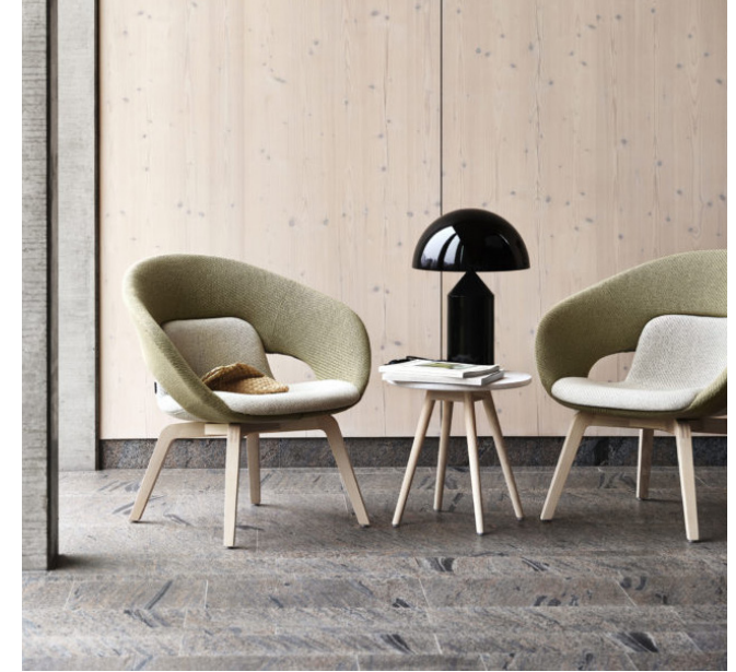
Scandinavian Spaces: Deli Lounge

The design is a little deeper, wider, and slightly more voluminous than the rest of the collection, providing the same artistic frame in a more comfortably reclined manner. Deli allows for contrasting upholstery to deliver a unique fashion, or the upholstered seat and back can be monochromatic for a sophisticated vibe. The legs come in solid ash, oak, or steel in various trendsetting hues. Read More